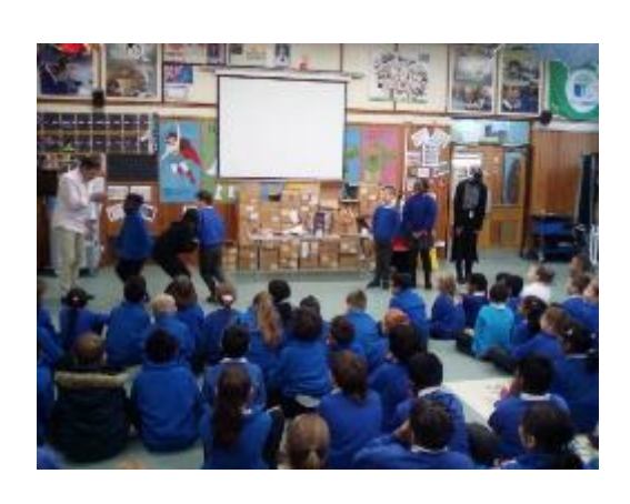
World Book Day